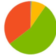
FY 2014 Individuals Served