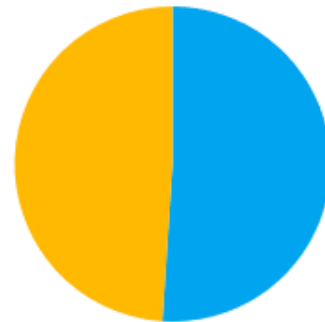
FY 2014 Expenditures