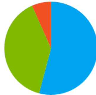
FY 2014 Expenditures