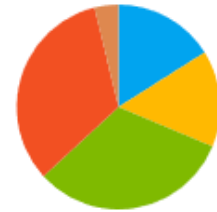
FY 2014 Individuals Served