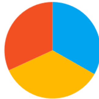
FY 2014 Expenditures